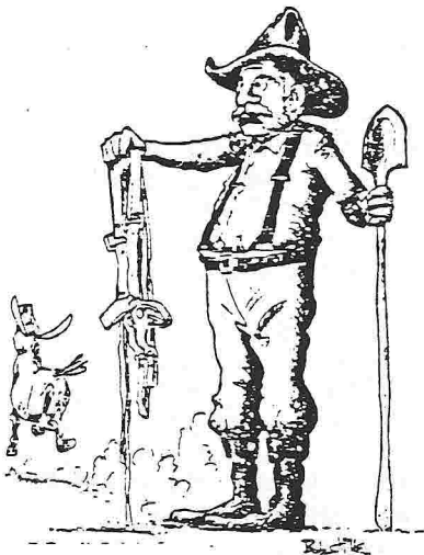
"Capture the Spirit of the Old West!"