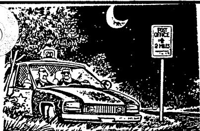
"WE SHOULD BE ABLE TO MAKE THIS MONTH'S SPEEDING TICKET QUOTA WAITING FOR LAST MINUTE INCOME TAX FILERS."

You can waste it or use it for good. What you do today is important because you are exchanging a day of your life for it. When tomorrow comes, this day will be gone forever, leaving in its place something that you have traded for it. You want it to be gain, not loss; good, not evil; success, not failure; in order that you shall not regret the price you paid for it.