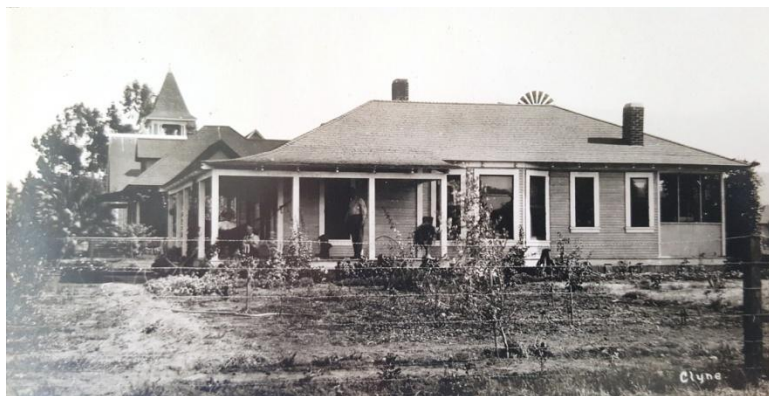
#49 9924 Maine ROSS HOUSE TODAY: LAKESIDE VETERINARY HOSPITAL Built 1904 ---