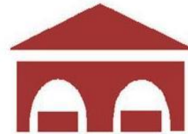
The Boathouse 1886

Gift Store Books, collectibles, souvenirs, more Hall Rental Meetings, reunions, seminars, etc. History Archives Photographs & History Museum FREE Admission Society Membership Wedding Chapel Rental