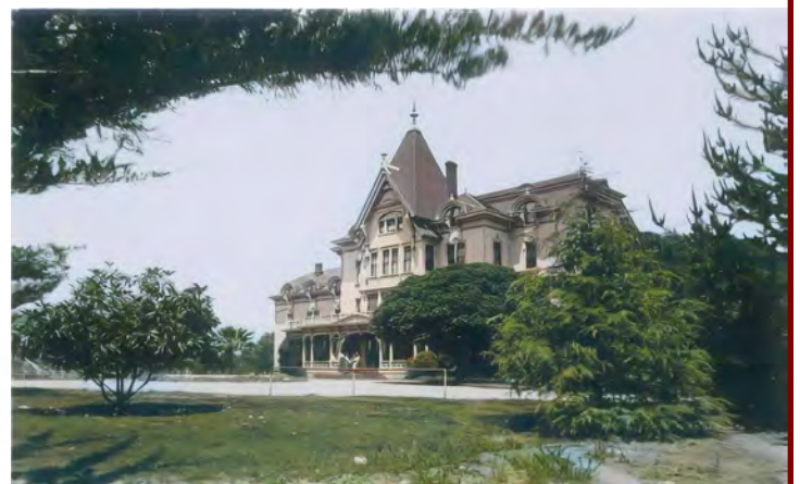
See old Lakeside IN COLOR! History comes to life at the March General Meeting.

Call us at (619)561-1886 for more information