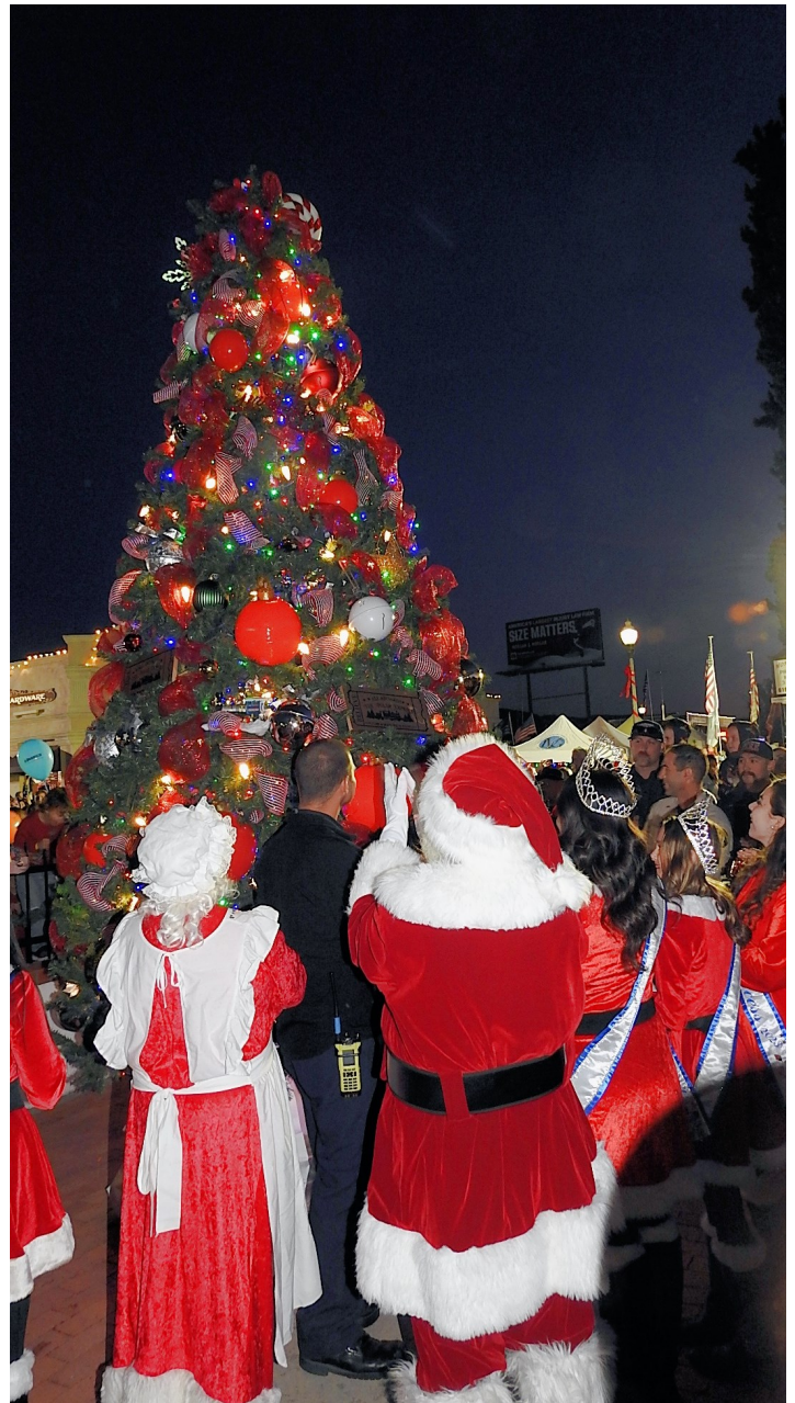
Spirit of Christmas 2023: Santa and Mrs. Claus admire the 2023 Spirit of Christmas Tree in the LHS courtyard. The annual Lakeside Chamber of Commerce event was held on Saturday, December 2 on Maine Avenue in the historic downtown district of our town.