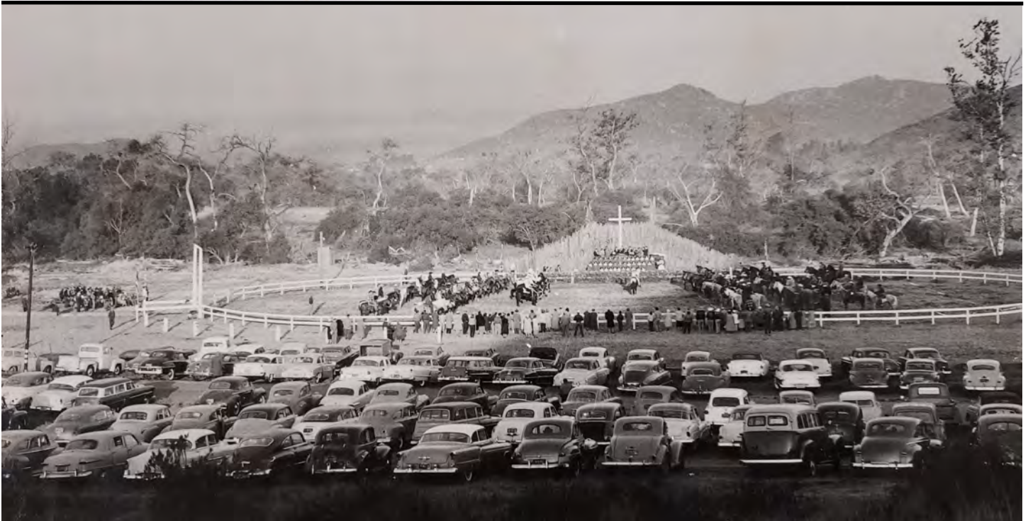
Sunrise services, Lakeside Frontier Riders, circa 1950's.