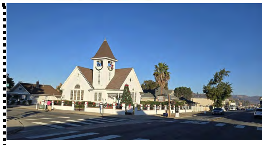
Another great photo from Billy Ortiz. Our beautiful historic church all dressed up for Christmas!