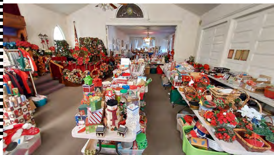
Shortly before our annual Christmas Resale Shoppe opened. By the way, we set another sales record this year!!