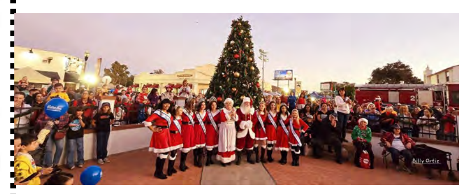
Santa,Mrs. Claus, and the 2024 Miss Lakeside ladies posing for the Christmas Tree lighting event at the Spirit of Christmas on Saturday, December 7, 2024.