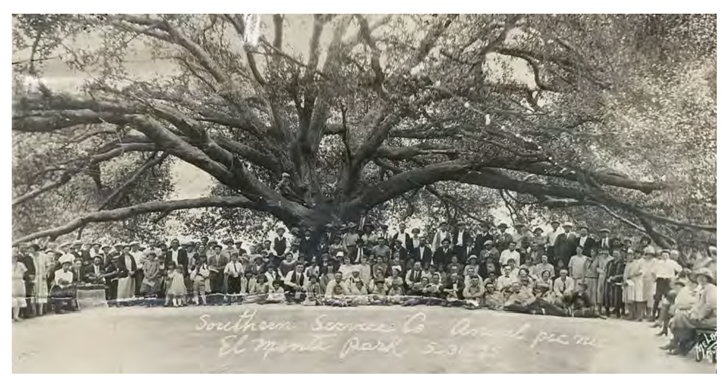
El Monte Park, May 31, 1925. An old postcard of a group photo at the annual picnic for the Southern Service Company.