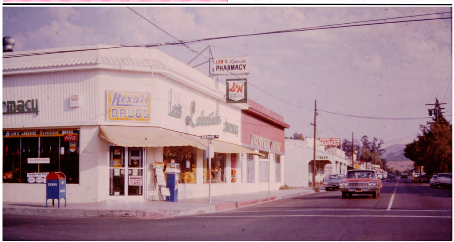
Recently acquired from eBay, a great slide dated 1966 looking south on Maine Avenue, with Leo's Lakeside Pharmacy on the southeastern corner of the intersection. This photograph is now in the LHS Archives collection.