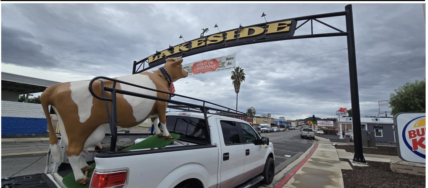
Bessie (or is it Betsy?) the cow, from the old Rocky Home Dairy, touring town before settling down in her new digs at the Grocery Outlet of Lakeside (not far from her original home). The "moove" is temporary; we just kind of ran out of room for her at the Olde Church—but she is still one of our prized possessions.